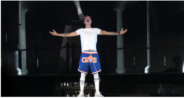
Justin Bieber fails to impress