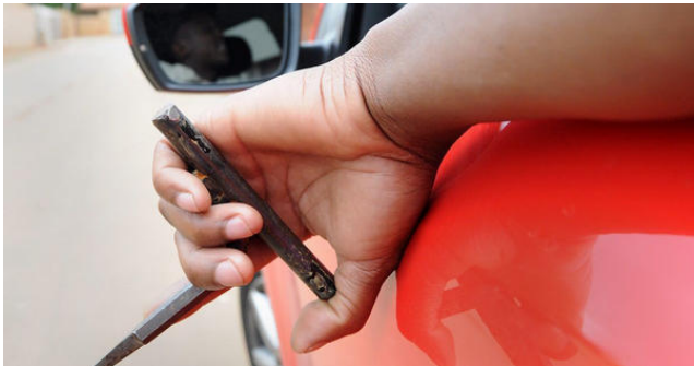
SA's car crime capital is.. (and it's not Joburg)