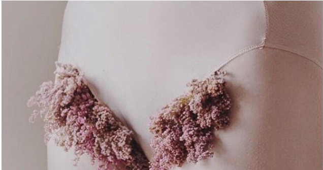
Myths about pubic hair